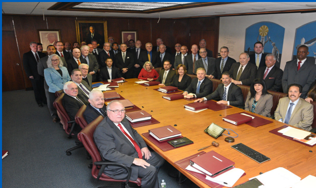
2018 JIB TRUSTEES

acts as both a third party administrator and a homegrown advocacy group for industry affairs. Composed of an equal number of Employer and Union representatives, the Joint Industry Board (JIB) stands as a testament to the power and success of the collective bargaining system.