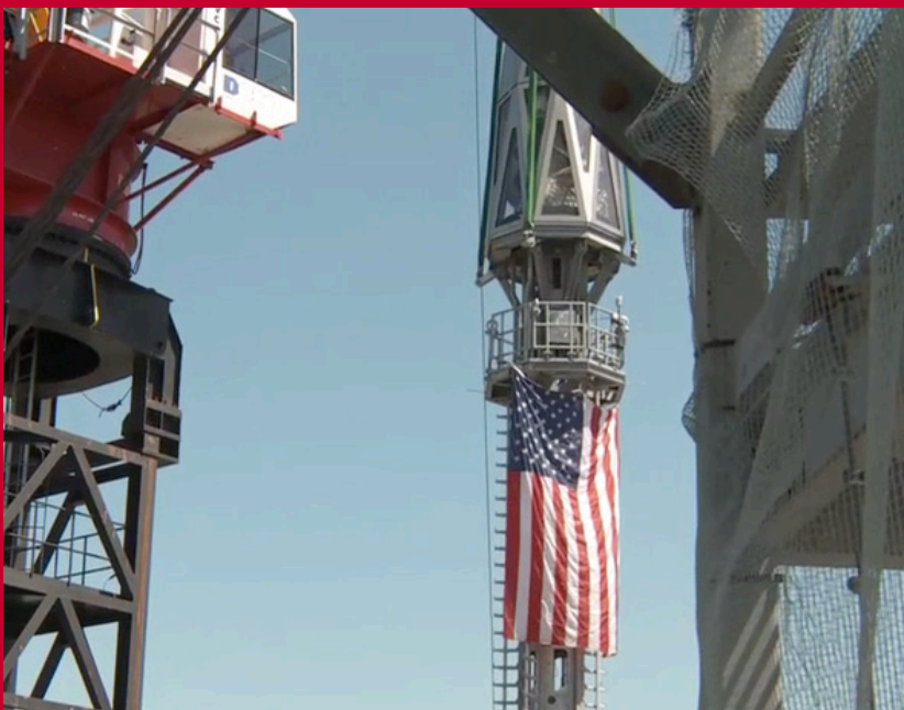
MAY 2, 2013 THE SPIRE IS HOISTED ATOP FREEDOM TOWER

Our Unity is our strength and together we will continue to move forward. ”