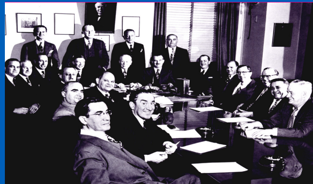
1943 JIB TRUSTEES