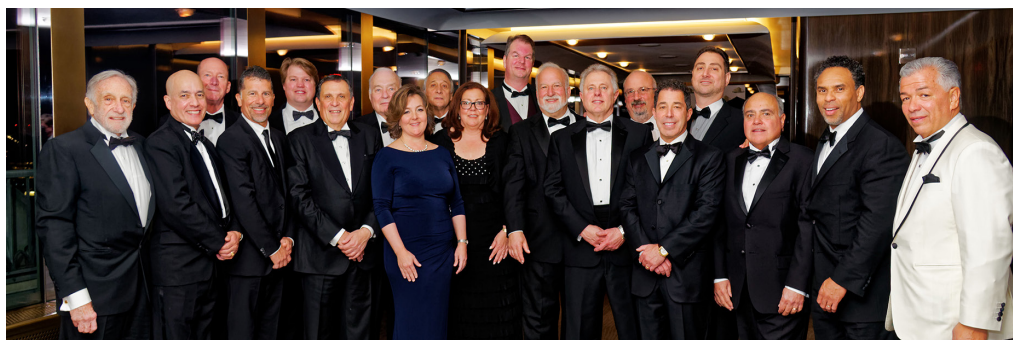
NEW YORK ELECTRICAL CELEBRATES ITS 125TH ANNIVERSARY

The New York Electrical Contractors Association and Local 3 IBEW have a shared commitment to providing the finest in electrical, light and power installations. This is its tradition and its future.